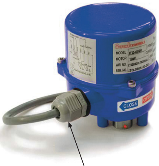
PG11 cable gland with wires